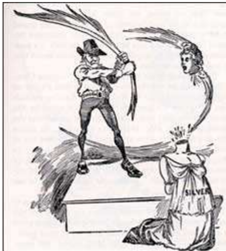
Silver -- the people's money -- was assassinated by a simple stroke of the pen in 1873.

On Feb. 12, 1873, Congress revised the coinage laws. By a simple stroke of the pen, silver was assassinated. The U.S. went on a gold standard and silver was demonetized except for payments under $5.00. A gold dollar became the unit of value and free coinage of silver was ended. Soon after the entire world demonetized silver and most nations went on a monometallic or gold standard. England had already demonetized silver in 1816 which paved the way for the gold standard and the fake money paper usury system that dominates the world today.