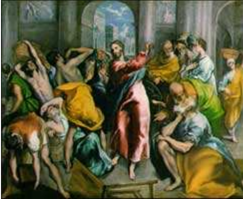
Jesus driving the moneychangers from the Temple by El Greco.

Rome, Rothschild, Rockefeller, Roosevelt...usury...usury...usury...usury.