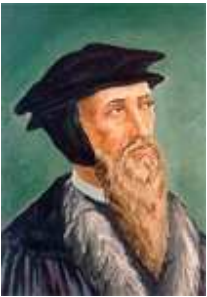
John Calvin (1509 - 1564).

Calvin also wrote commentaries on all the books of the Bible. Here is a small sample of the pro usury writings of this double-minded man: