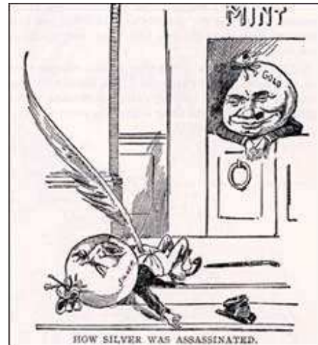
Gold -- the rich man's money -- was now king.

With half the world's money supply demonetized, gold became an even more precious commodity and an item to be hoarded. Tons of it left the United States. The death of silver led to the fake money or paper system and usury on a colossal scale.